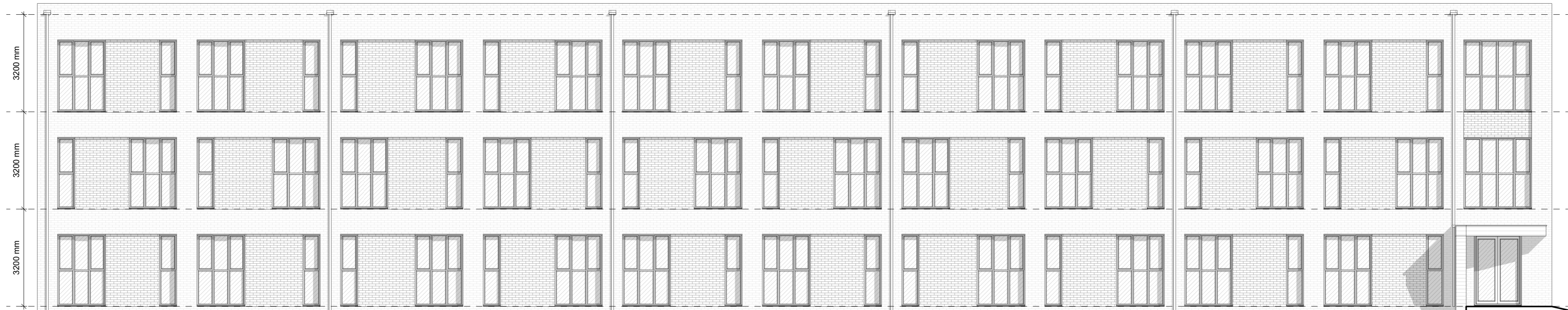
Front Elevation 1 : 100